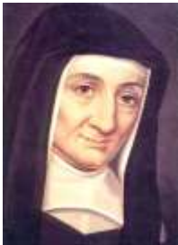
St. Louise de Marillac (Co-founder of the Daughters of Charity)

L: Blessed Rosalie Rendu, All: Pray for us