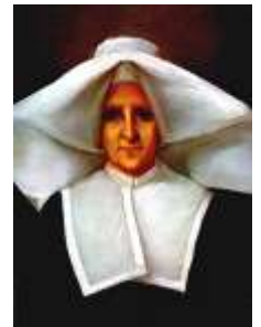
Blessed Rosalie Rendu, DC (Co-founder of the Society of St. Vincent de Paul)